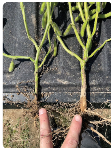
Left: UNTREATED Right: INCITE