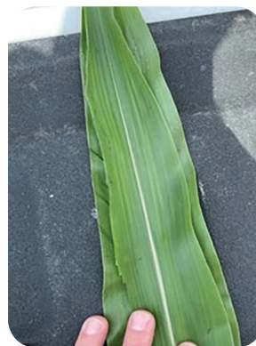
Top Leaf: UNTREATED Bottom Leaf: INCITE